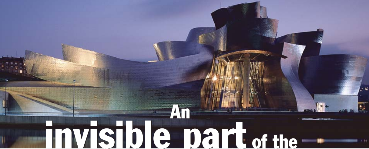
CHRISTIAN RICHTERS FOTOGRAF